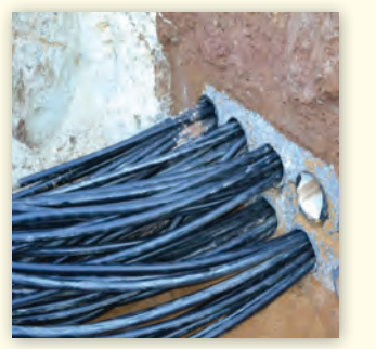
6" PVC sleeves with 10 lines of PSII each.