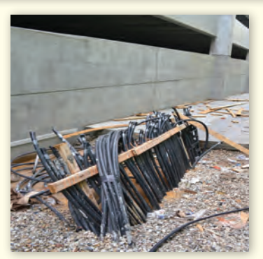
PSII coming up to connect with CounterStrike.

They have been a quality Plumbing, Heating and Air Conditioning contractor for 35 years and have served thousands of households and businesses!