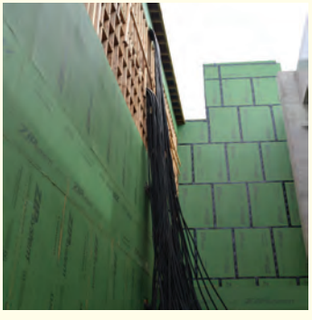
CounterStrike install to appliance.