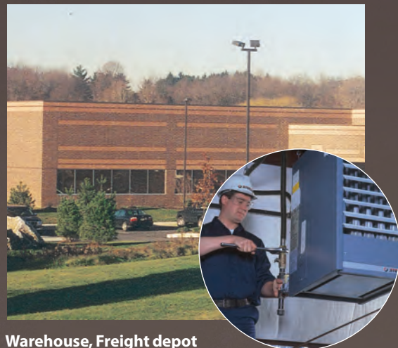
Warehouse, Freight depot