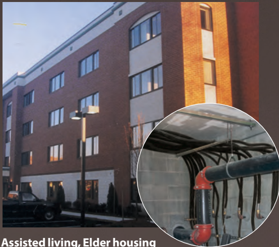
Assisted living, Elder housing

"We saved two man-weeks on our high school renovation project by choosing flexible CounterStrike over rigid black pipe. We simply pulled long runs through PVC pipe over existing ceilings. CounterStrike is a great new way to run gas piping in our commercial jobs."