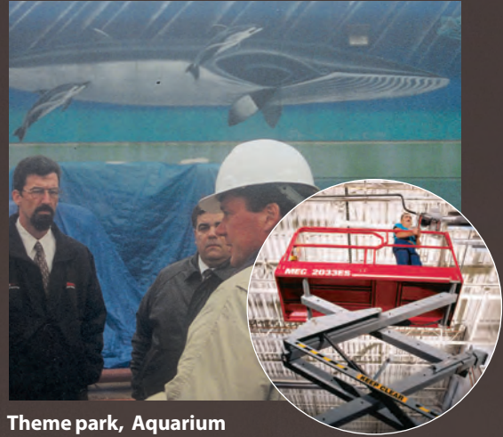
Theme park, Aquarium