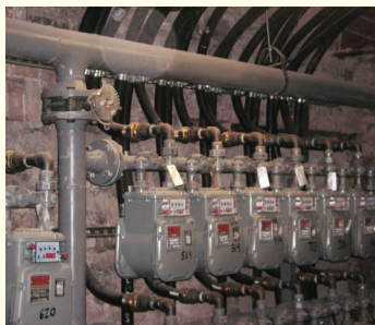
According to David Morrison President of H&M, "the excellent response times from OmegaFlex made the choice of using CounterStrike an easy one."

CounterStrike CSST's higher flow rating compared to other brands, helped H&M achieve additional cost saving versus lower priced yellow CSST. This is because it is often possible to use smaller pipe diameters with CounterStrike compared to competitive brands. For the Hotel Lafayette job it is estimated that because of CounterStrike's size advantage made for additional material cost saving on this gas piping installation over the leading yellow brands of CSST.