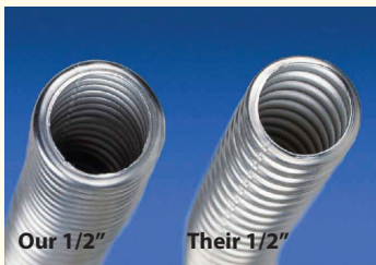
CounterStrike has larger pipe diameters compared to competitive brands, so save money by using a smaller size CounterStrike!