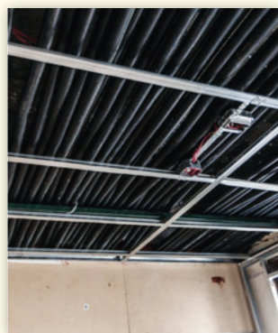
According to David Morrison, President of H&M, "we saved $270,000 by using CSST instead of black iron pipe."

All of the condos/apartments in the restored hotel featured a natural gas furnace, stove and hot water heater which required the gas pipe to be run up the first seven floors from the basement. The job was originally quoted using yellow CSST (Corrugated Stainless Steel Tubing). However CounterStrike® was requested to quote on this job by its local NY wholesaler due to its superior features.